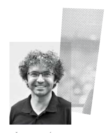
ONDŘEJ BESPERÁT Photographer

Jenda.Zacek@AspenInstituteCE.org @JendaZacek